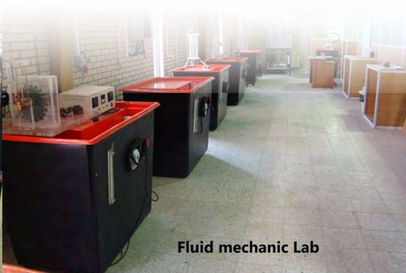
Fluid mechanic Lab