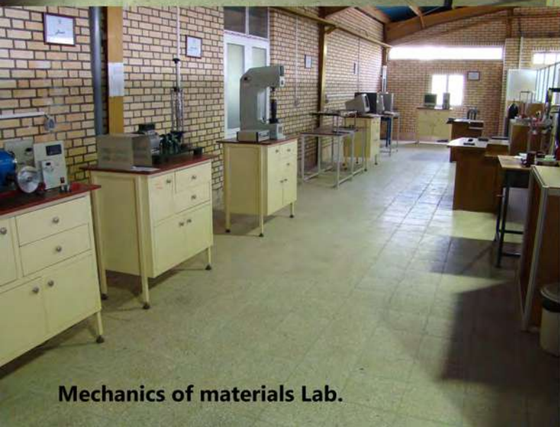
Mechanics of materials Lab.