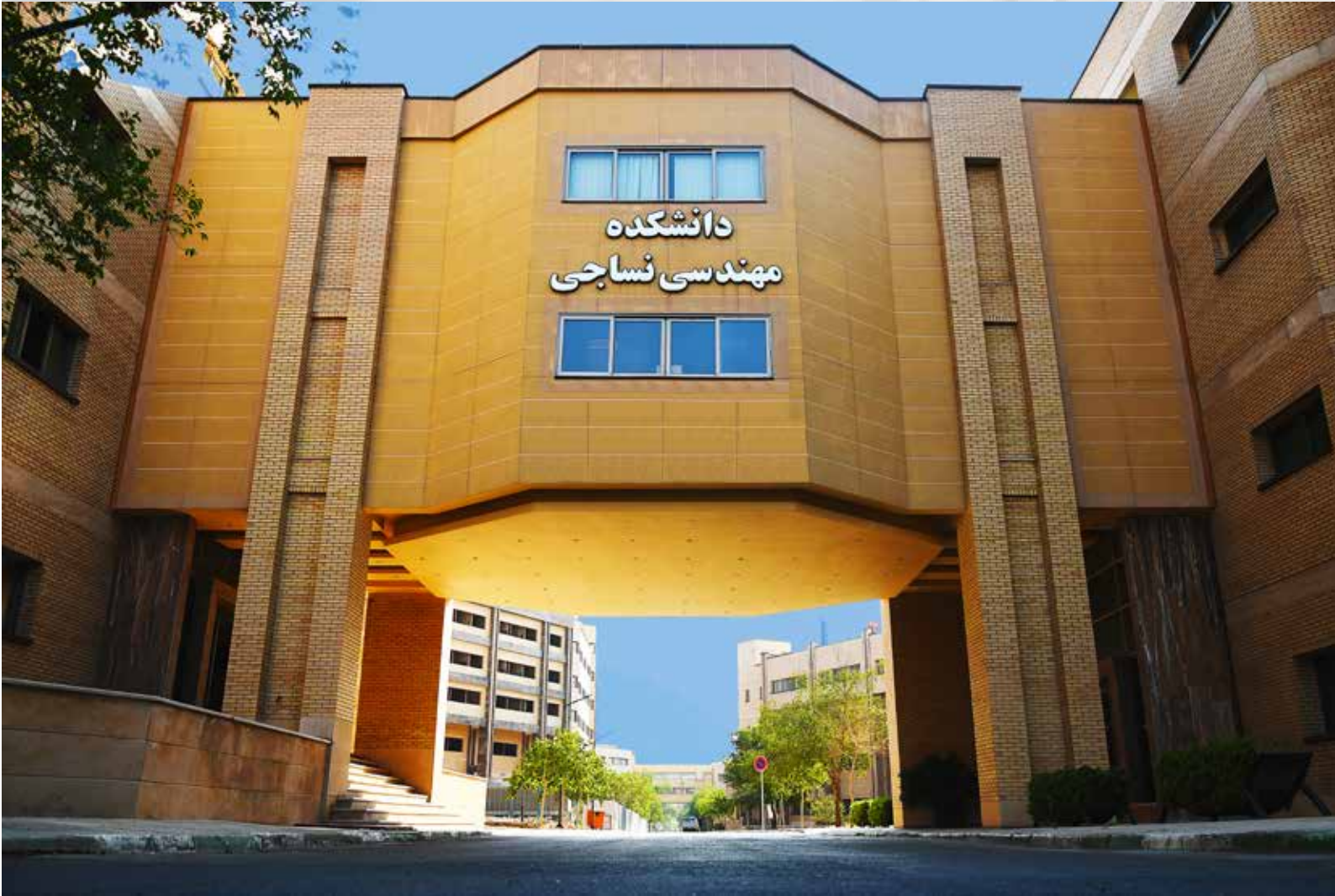
Department of Textile Engineering